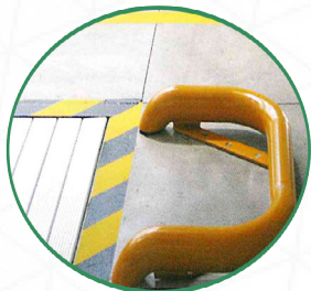
Vehicle entrance guide