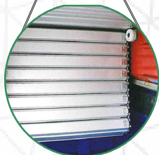
Gemco Pit Cover storage area