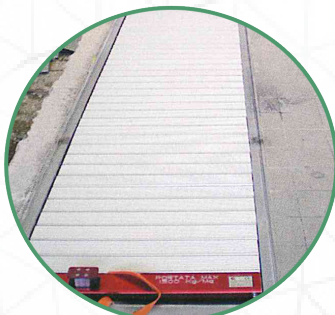
Gemco Pit Cover complete and closed