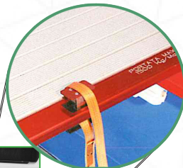
Locking Stave (Manual Versions)