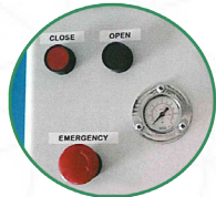
Control panel for the air system

European patent application no. 10178031