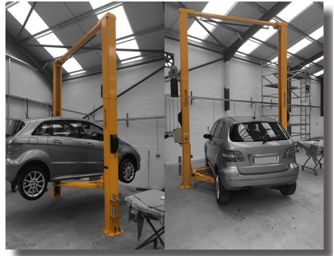
H2401G & H2403G

LinkedIn: GEMCO Sales & Service Facebook: GEMCO Sales & Service Twitter: @GemcoEquipment