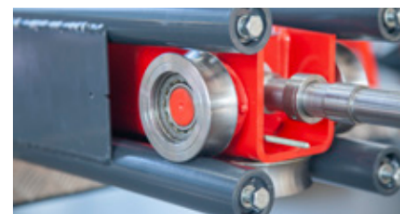
Stable, welded post