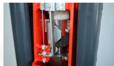
Nylon nut sets

The Autopstenhoj Maestro 2.60 NxT is the latest addition to our high quality range of vehicle lifts.