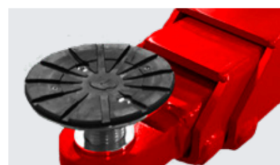
Double telescopic arm with F-pad